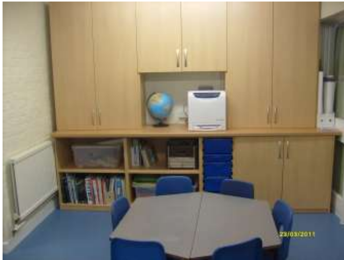
The newly refurbished resources area- March 2011

We are currently completing an overhaul of our ICT infrastructure, providing all classrooms with fast broadband access, new computers in four classrooms and additional computers in a further two. This has coincided with the exciting launch of the Oakley Lower School Learning Platform, which provides another link between home and school. All parents should have received a user name and password for their child to access the site via the OLS website. Completed over half term was the refurbishment of the cookery area to the rear of the reception unit and adjoining communal area to make maximum use of the school building.